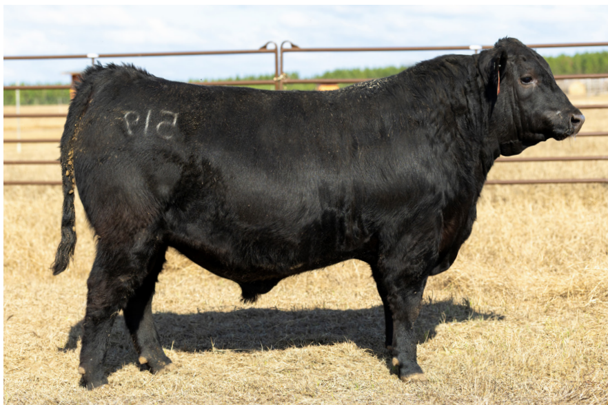
IPR Triumph 519 | Lot 46