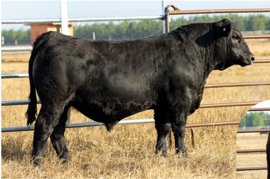
YVSF Black Stallion 988N | Lot 94