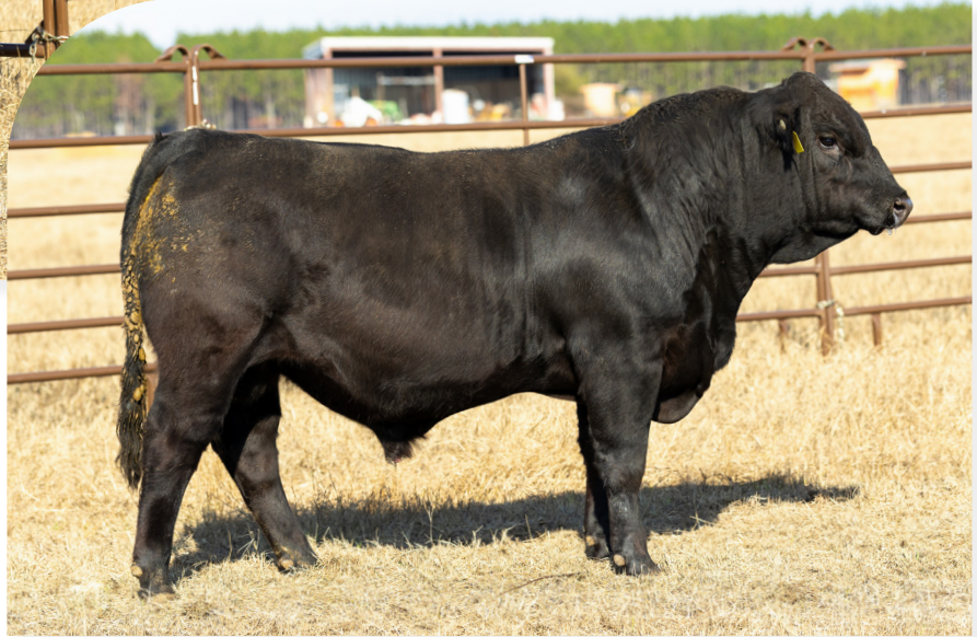
MPF Bedrock M159 | Lot 90