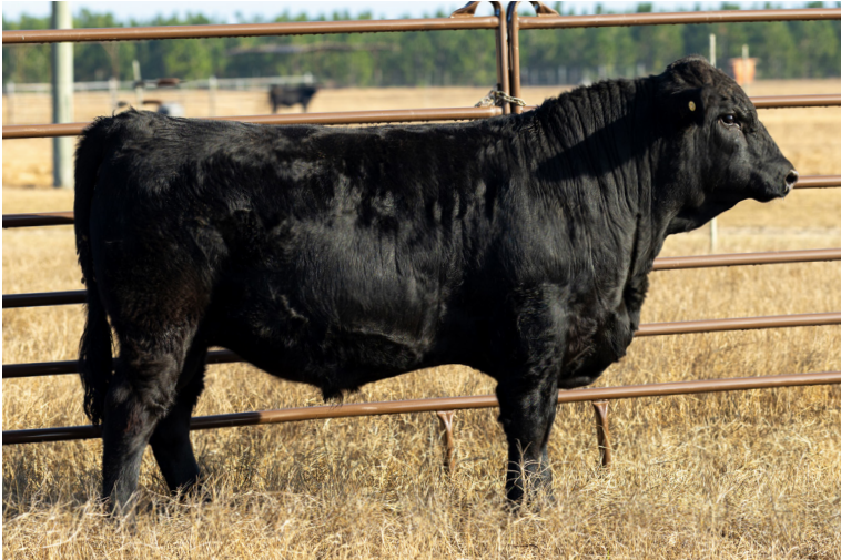
DRG Monroe 38M | Lot 102