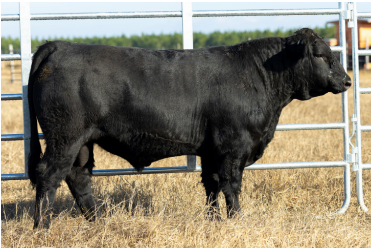
YVSF Hercules 980M | Lot 101