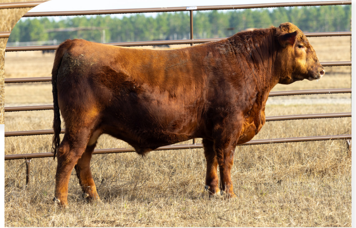
JJN Mr. 111M | Lot 96