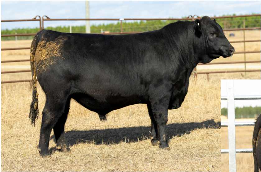
GAF Winchester 422 | Lot 57