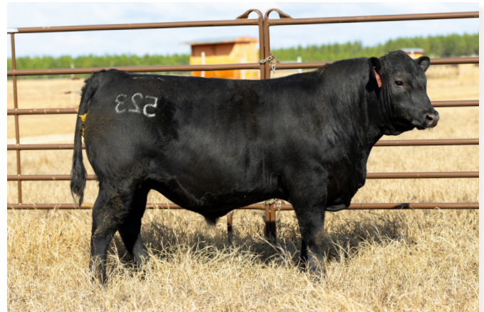
IPR Galavant 523 | Lot 48

With an 11 CED, WD Yellowstone 116 is safe on heifers of course and his calves are sure to grow, but don't miss the opportunity to raise some nice replacements with top 30% heifer pregnancy and a $EN ranking that is hard to find.