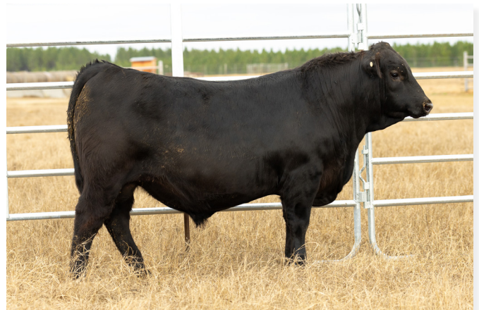
B/A Rogers 5422 | Lot 20