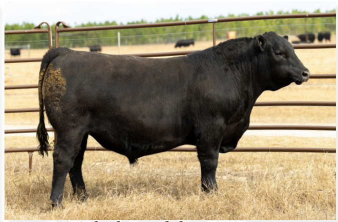
BAF Black Bandolier B745 | Lot 31