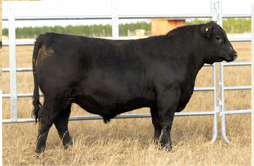
GAF Exponential 427 | Lot 59