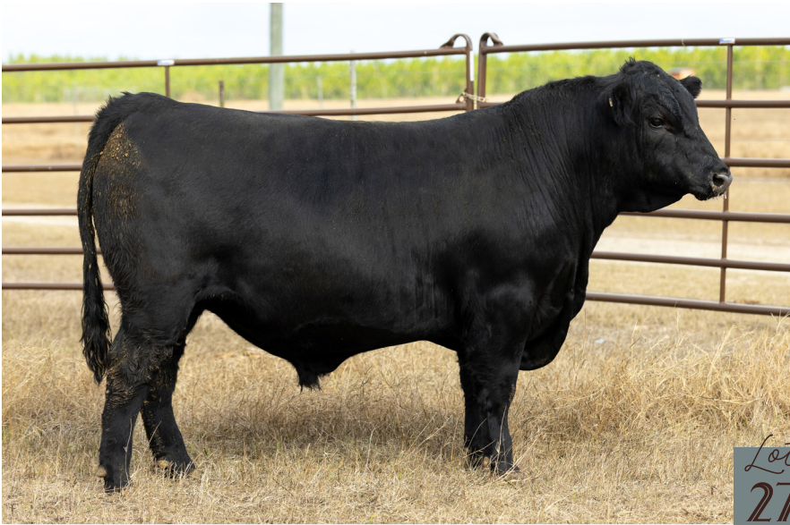
BAF Winchester B715 | Lot 28