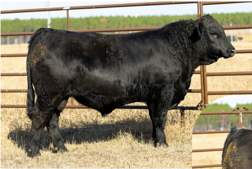
MPF Klondike M149 | Lot 88