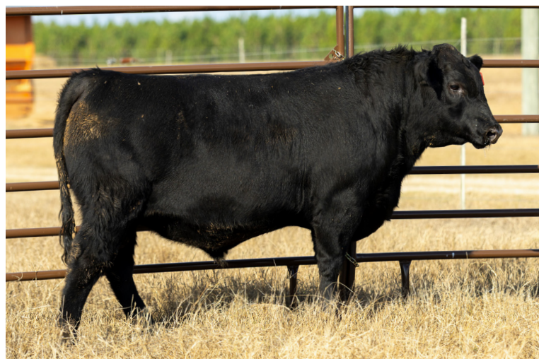
Pinhoti Veracious 585 | Lot 78

Consignor: Pinhoti Ridge Farms Double digit calving ease with balanced traits. Full brother to Lot 82. Dam is known for her easy keeping, excellent feet, beautiful udder & front pasture replacement daughters.