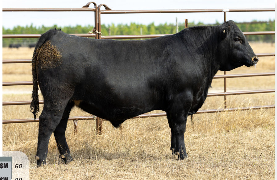
B/A Rogers 5001 | Lot 10