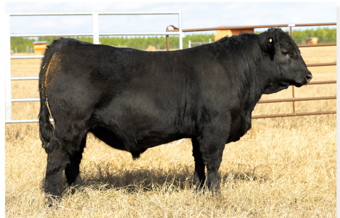
ED Yellowstone 804 | Lot 49