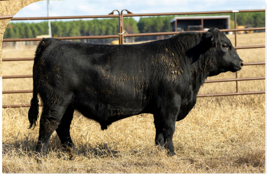
Pinhoti Veracious 561 | Lot 74