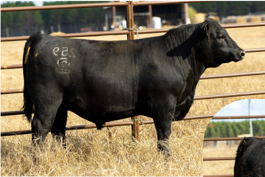
JRBC Rival 259 | Lot 72