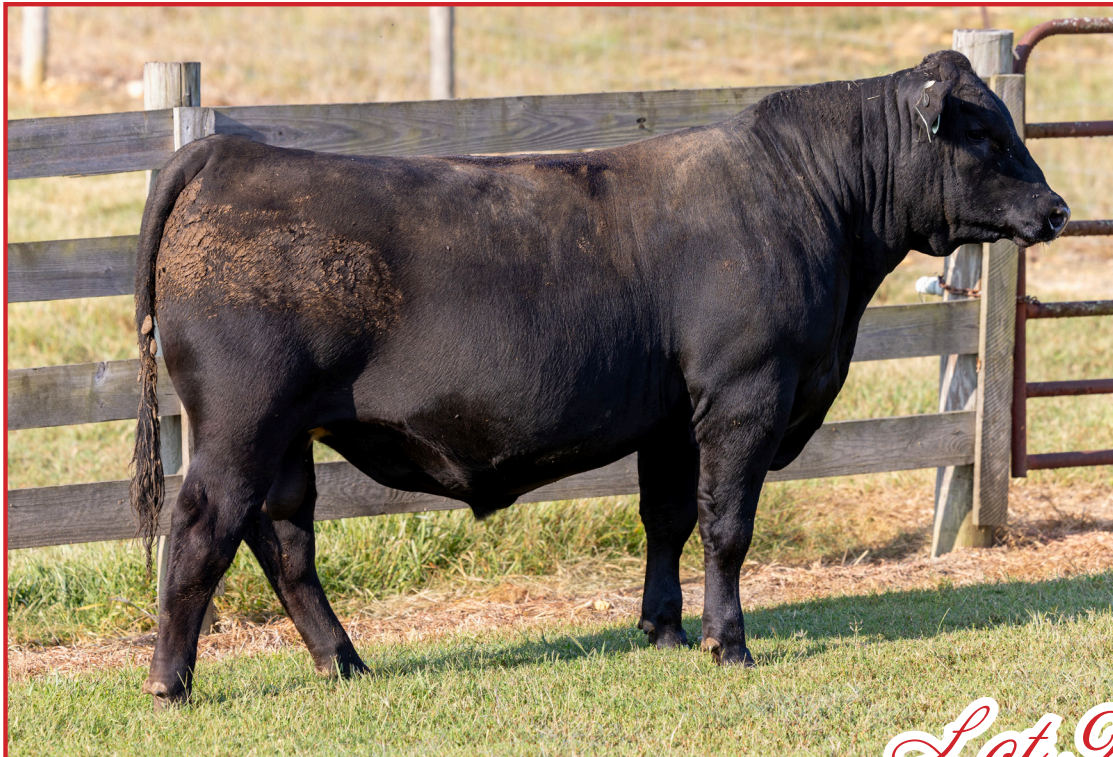
Lot 98 High Indexing Bull

#1 Overall High Indexing Bull/ Heifer Safe/ Top 15% Calving Ease, Weaning Wt, Yearling Wt, Claw, Top 4% Docility, Top 10% Marbling.